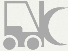
PAPER ROLL SPECIAL