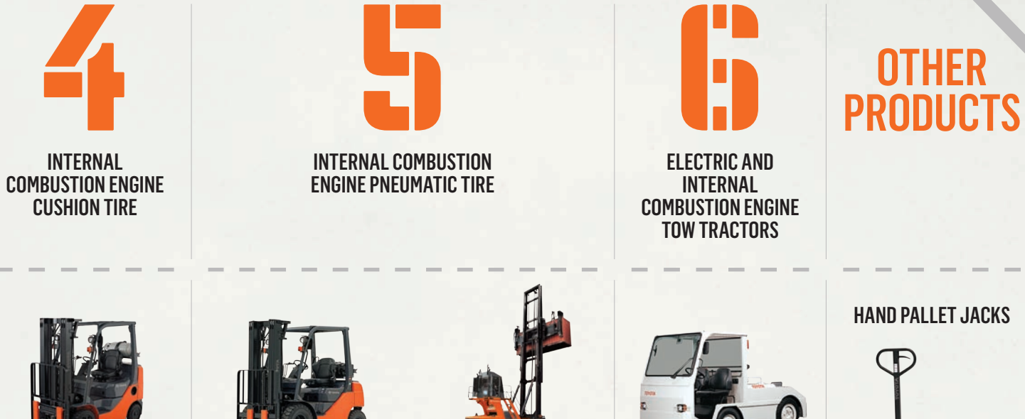
Core IC Cushion